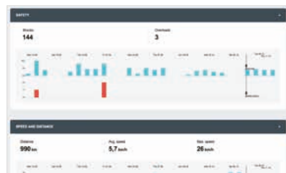
View each driver's performance in real time.