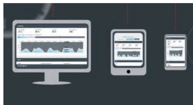
Access on mobile, tablet or traditional screen.

Kalmar Insight* comes fitted in all new Kalmar machines and can be retrofitted to existing Kalmar machines or those built by other manufacturers.