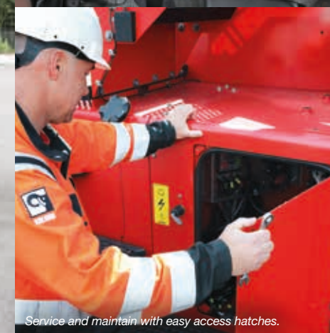
Service and maintain with easy access hatches.