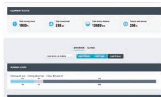
Plan your maintenance and spare parts needs.