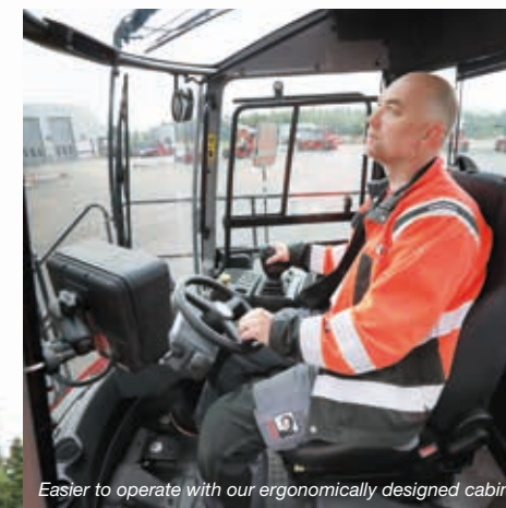
Easier to operate with our ergonomically designed cabin.